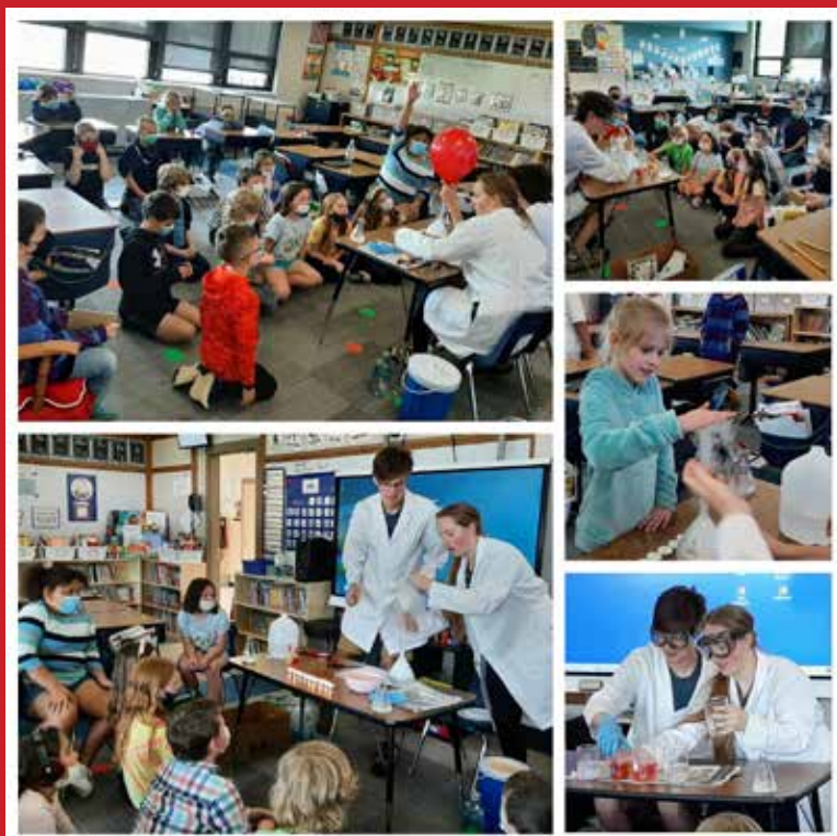
SBHS AP Chemistry students share Science concepts and hands-on learning with 3rd grade students at Sunrise Elementary.

Free meal and childcare are provided. If you have any questions about the topic or presenters, please call 920-746-2804. We look forward to seeing you there!